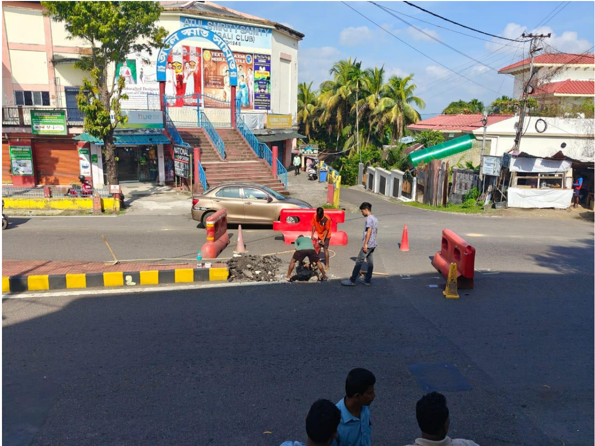
Road digging for repairing of damaged UG cable of Lamba line feeder at Bengali Club Junction